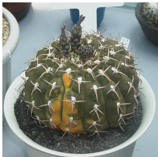
G. bodenbenderianum varieg. (守殿錦)