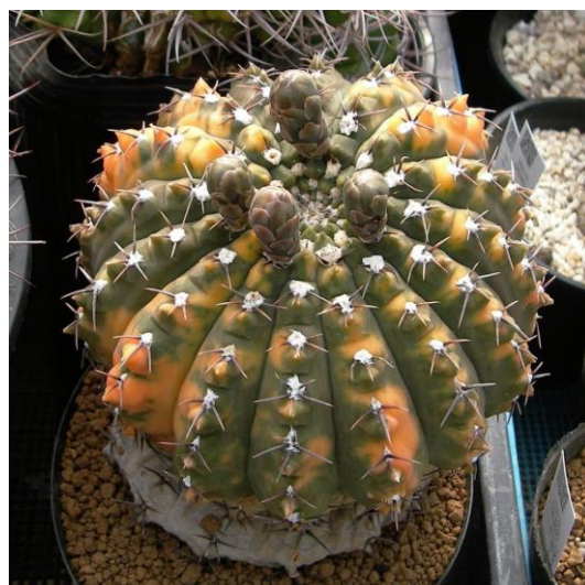
G. bodenbenderianum varieg. (守殿錦)