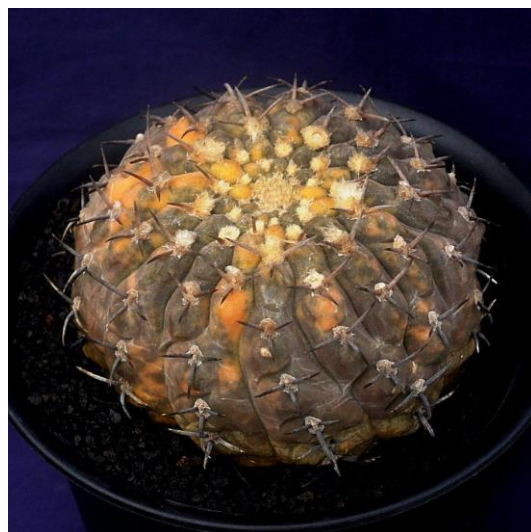
G. bodenbenderianum varieg. (守殿錦)