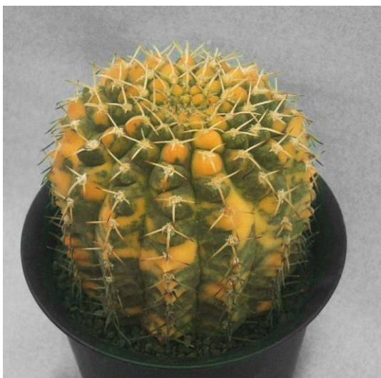
G. bodenbenderianum varieg. (守殿錦)