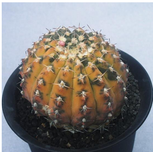
G. bodenbenderianum varieg. (守殿錦)